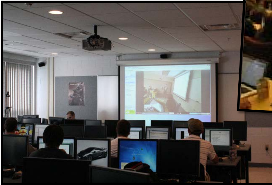
DuBois and Fayette