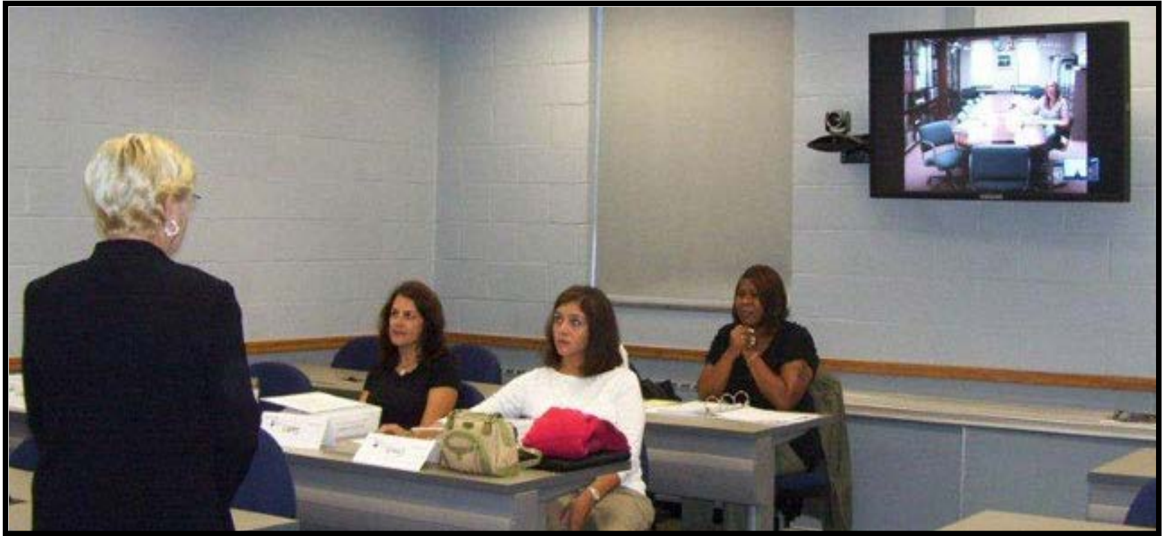
Penn State Greater Allegheny